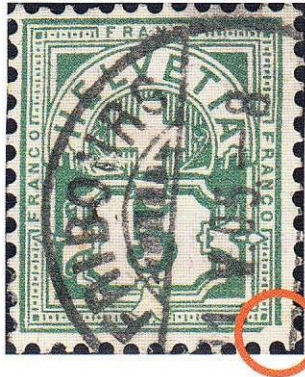
Fig. 7. Fifth error. 65B.6.5.9

As you can see, all of these errors of the outer frame are not as rare as represented in the Zumstein Spezialkatalog .