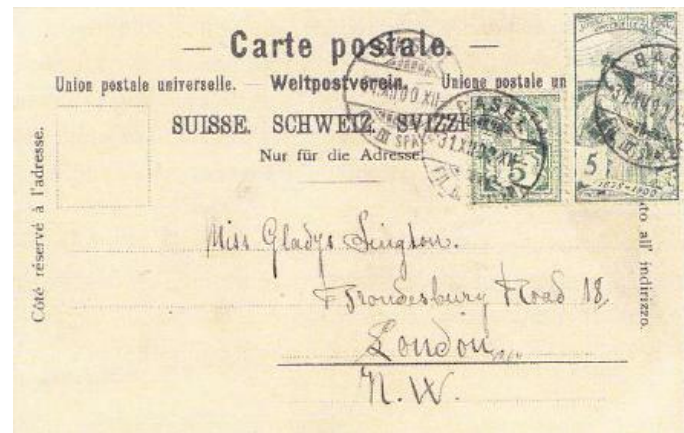
Fig. 6. Postcard from Basel to London franked with 10cts. (postcard rate from 1.7.1875 to 31.1.1921); 77C, 65B.4.3 13, DR: 4