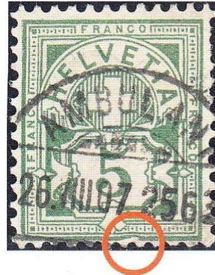
Fig 9: Sixth Error. 65B.7.6.24, DR 6.