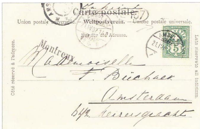
Fig. 5. Postcard from Montreux to Amsterdam franked with 5 cts. (this was sent as printed matter – printed matter rate from 01.01.1875 until 01.31.1921, 5 cts. per 50 g). 65B.4.3.2, DR: 6. Postmarked Montreux: postmark group 39a.

We will find the fifth error (Fig. 7) on the 6 cts. (5th reprinting, 1904-1905); it takes the form of a very large fracture in the lower right (G6), 7 DR.