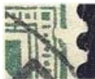
Fig. 3. Third error. 65B.4.3.13, DR 4