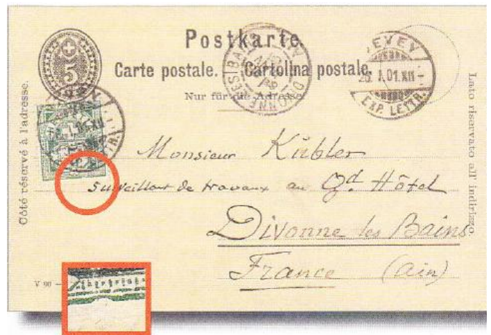
Fig. 10 Postcard from Vevey to Divonne-Les-Bains franked with 10 cts. (Postcard tariff from 01.07.1875 to 31 12.1921). PK 26, 65B.4.3.24, DR: 6

Passion, imagination & experience in producing top results