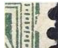
Fig. 4. Fourth error. 65b.4.3.14, DR 1

The greatest pleasure for a philatelist is to find these errors on documents. The postcard (Fig. 5) has the first error (65B.4.3.2, DR 6).