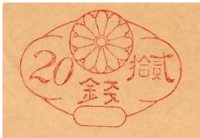
Early Universal meter stamp essay not accepted in Japan (Bernard Lachat, page 3).