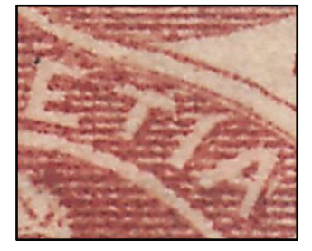
Fig. 1 - 68E

Three stamps of the 68E, with the details.