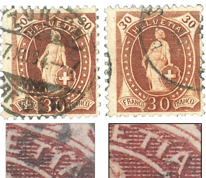
Fig 5. - This stamp is also a 68De, but this time position 225. The retouching is clearly visible on the enlargement.

Fig.4 - The stamp below is a 68De with the plate defect. It is position 125 and the printing is done with the printing plate IIa. This position was never retouched.