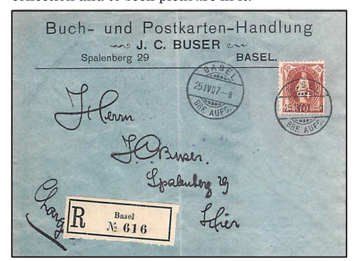
Fig 6 - Finding these defects on covers is even more interesting. The cover shown is interesting, even if it is obviously philatelic (it has superfluous franking; the correct postage would have been 15 centimes).

I will end with a proverb from Protagoras: "The science of philatelic happiness is to love one's collection and to seek pleasure in it."