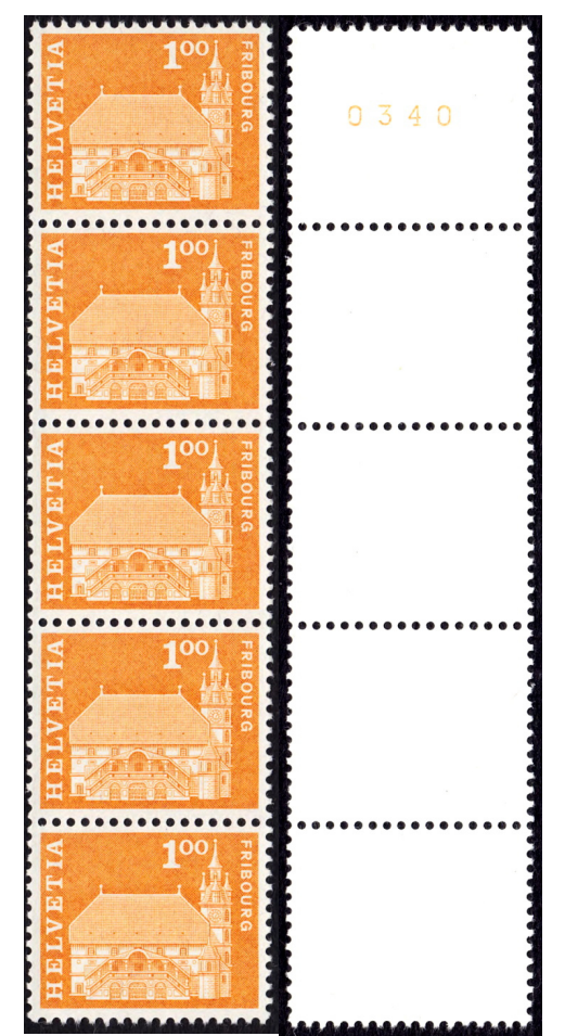
Figure 1. Coil strip of Zumstein 356RLM, control 0340.