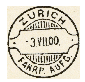
Fig. 1: Cash on delivery of CHF 10 from Zurich to Zurich. The rare arrival mark can be found on the back (Zumstein postal stationary 35, SBK 104)