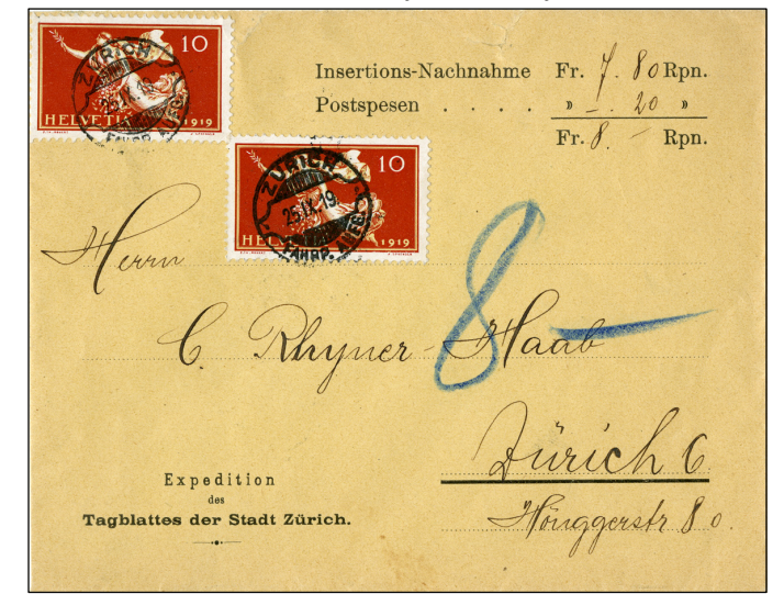
Figure 4: Cash on delivery letter from Zurich to Zurich with 20 Rp. franked (SBK 2x144) with clean strikes.

The period of use of this canceller, from April 25, 1899 to June 29, 1923, makes it possible to find it used on different stamp issues. This extended from the numeral patterns to the 1919 peace stamps, as illustrated in the next examples (Figures 4 & 5). It is also amazing that the canceller did not suffer any defects during its entire period of use and was never repaired. One must, therefore, assume that the postal worker treated his work tools very carefully.