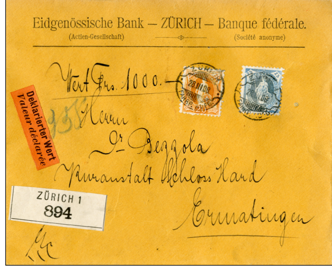
Fig. 3: Insured letter with a declared value of 1,000 francs from Zurich to Ermatingen. Seal on the back