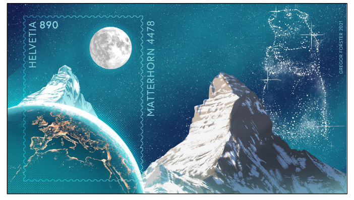
Figure 2 - Matterhorn with Marmot, 350 issued

also building a bridge from the physical to the digital world in philately. Classic stamps have always been collected, traded and exchanged physically. With the crypto stamp, this is now also possible online in the blockchain. The stamp thus becomes a digital collector's item. Swiss Post itself does not operate a blockchain platform on which Crypto Stamps can be traded. Anyone who wants to trade, sell or exchange the Crypto Stamp must do so in an existing Blockchain application.